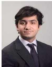
Zohaib Abubaker Ziauddin College