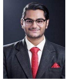
Ameya Kumar Gandhi Medical College